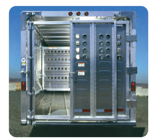
The Merritt Gooseneck also features a full width swing door with a built in driver-side sliding half door and a full width dock bumper.

Disclaimer Statement: Merritt Equipment Co. reserves the right to make changes in materials, components, designs, equipment specifications and trailer models without notice. All visual specifications, representations, volumes and dimension references are based on the latest product offerings and are approximations available at the time of this publication. At no time will the information contained within this publication be used as the basis for resolving disputes.