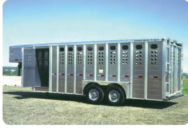
Merritt's punched aluminum panel construction keeps livestock well ventilated. The 34" wide driver-side swing door is standard on all Merritt Gooseneck trailers.